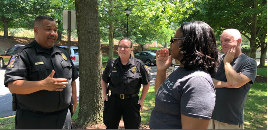
Coffee With A Cop (June)