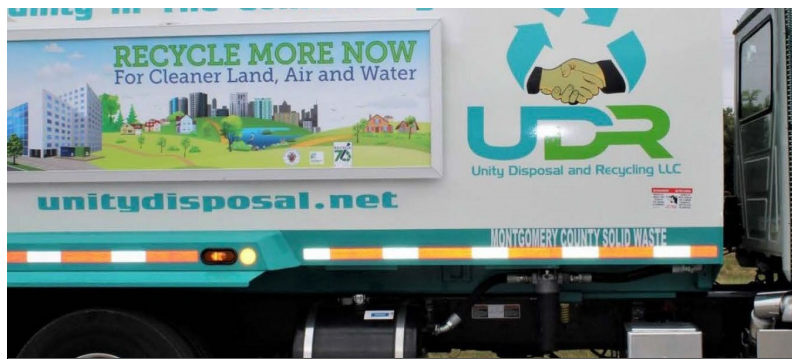
Unity Disposal & Recycling