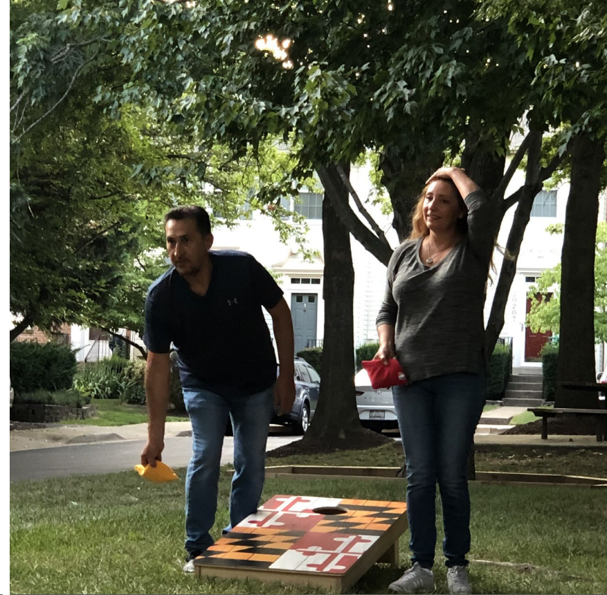
“Game of Throws” Cornhole Game