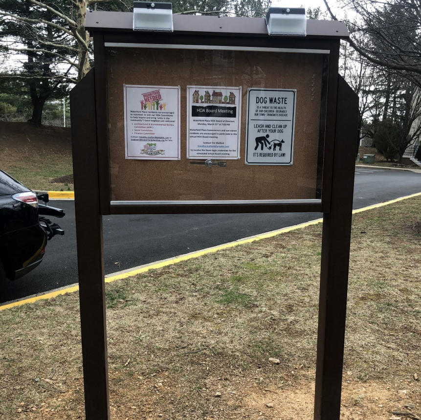
Community Message Center Board