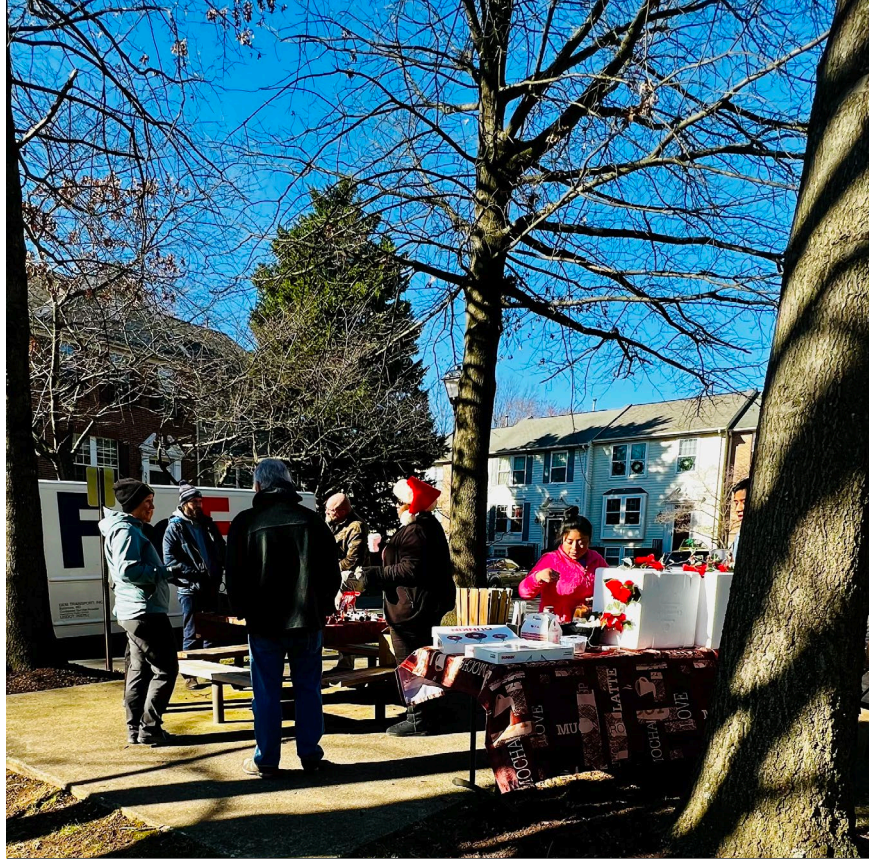
Coffee With A Cop (December)