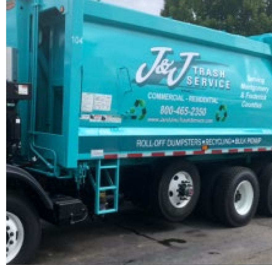
J&J Trash Service