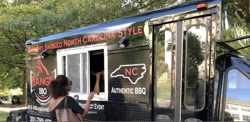
Food Truck Fridays