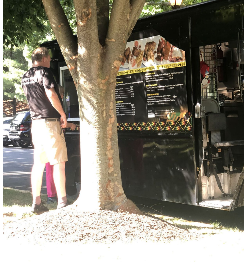
Food Truck Fridays