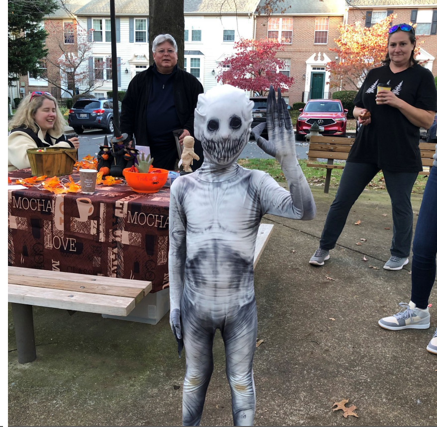
“Almost Halloween” @ Waterford Place