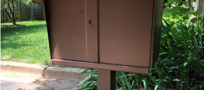
CBUs (mail receptacles) Refurbished