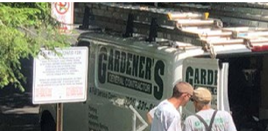
Gardener's General Contractor