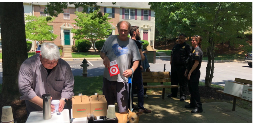
Coffee With A Cop (June)