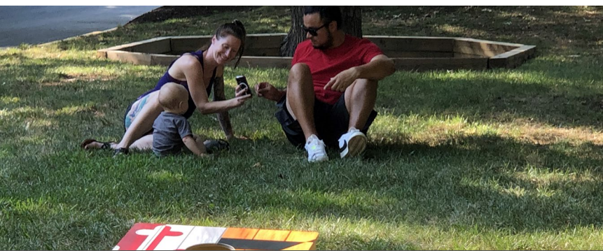
Food Truck Fridays