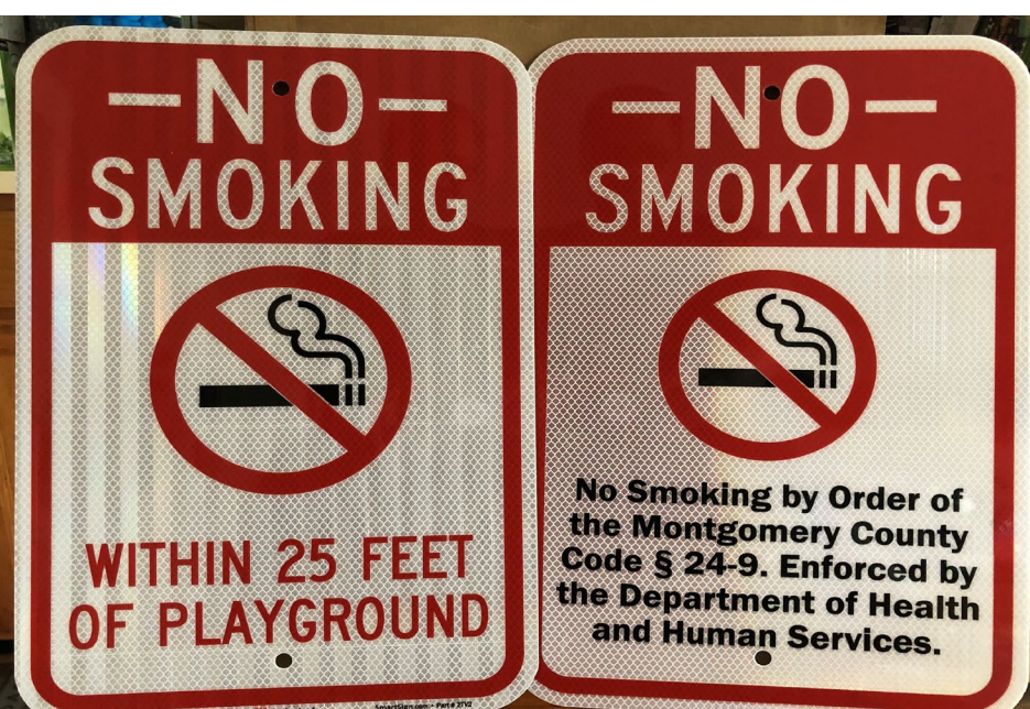
New Mandatory "No Smoking" Signage

Community Playground Area Upgraded to Accommodate Ages 2-12 Years Old (new playground was installed/completed December 1st)