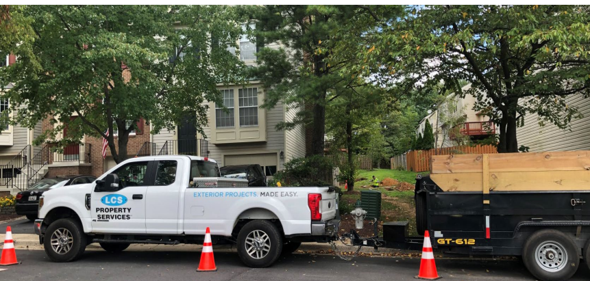
Stormwater Drainage Improvement Project for Playground Area (Tot Lot)