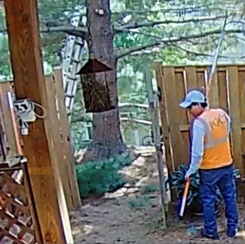
PGC Landscape (Tree Care Services)