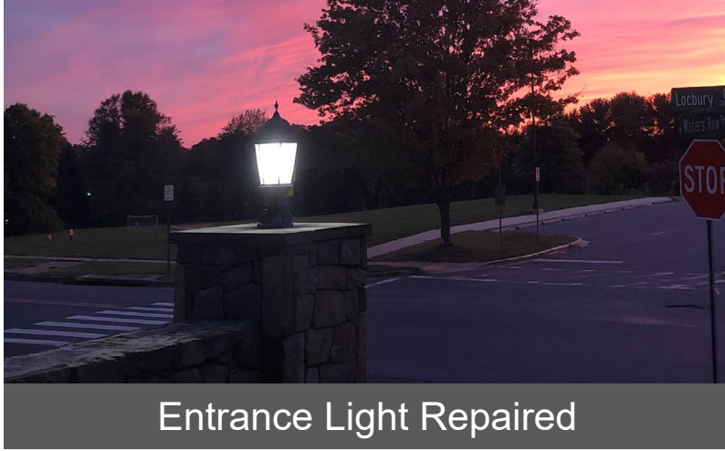
Entrance Light Repaired