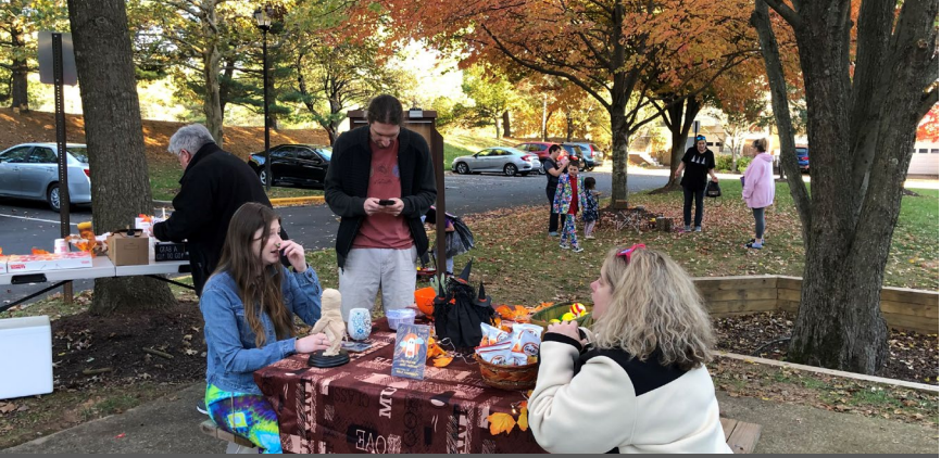
“Almost Halloween” @ Waterford Place