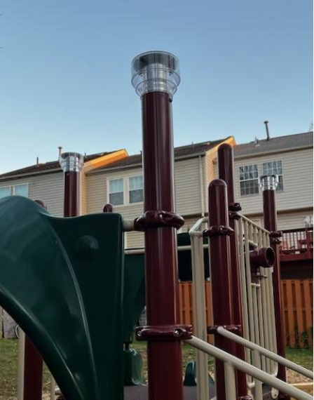
PlaySoleil™ Solar Lighting was added to increase playground security after dark.