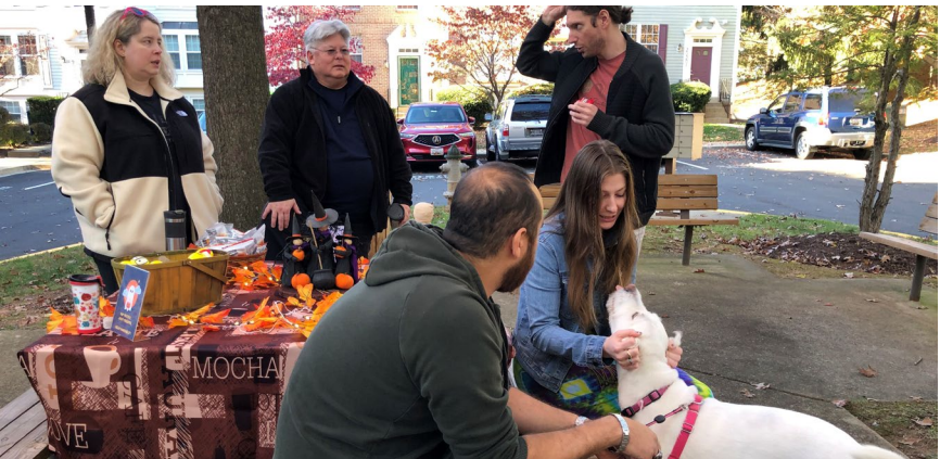
“Almost Halloween” @ Waterford Place