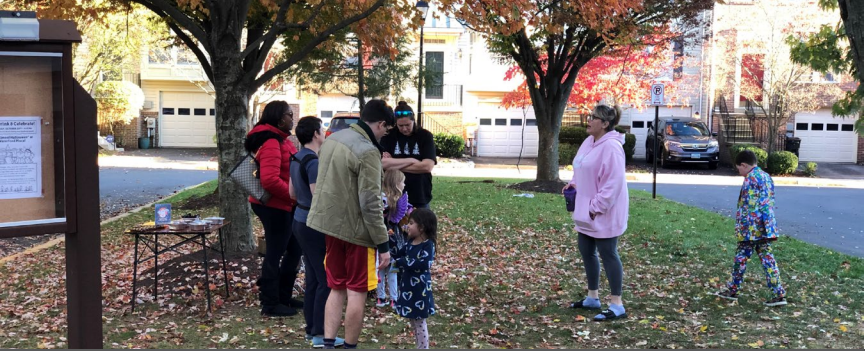
“Almost Halloween” @ Waterford Place