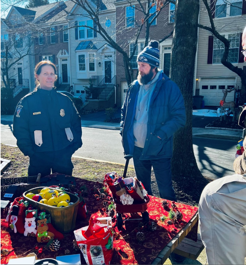
Coffee With A Cop (December)