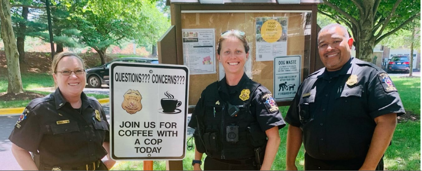
Coffee With A Cop (June)