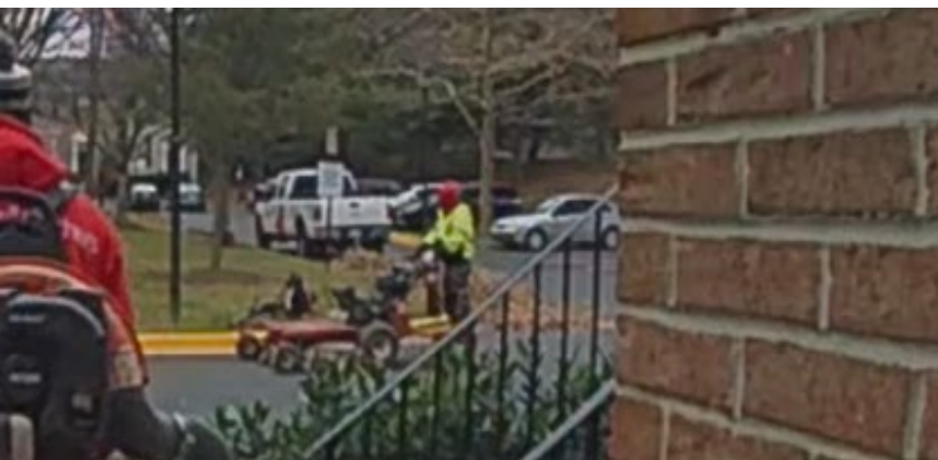
Howell Brothers Lawn & Landscaping

Providers of Grounds Maintenance, Trash Service, and Recycling Service