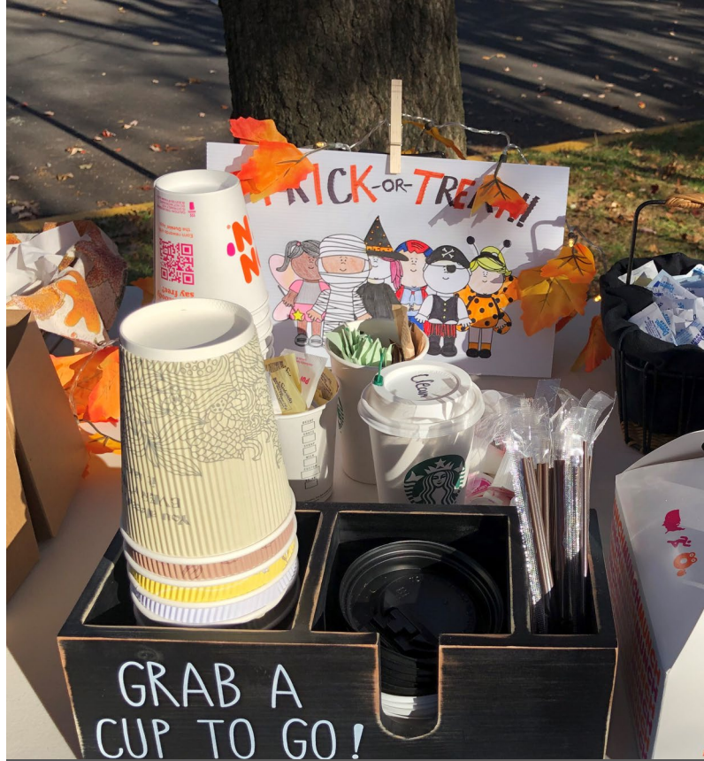
“Almost Halloween” @ Waterford Place