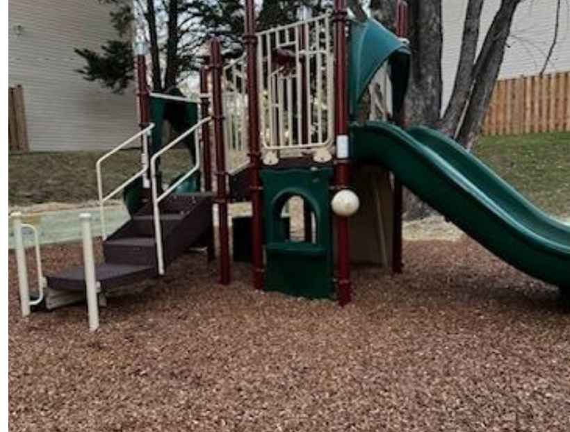
New Woodcarpet® EWF play surface