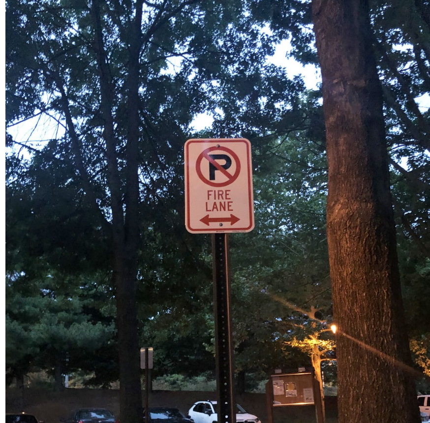
"No Parking Fire Lane" Signs Replaced