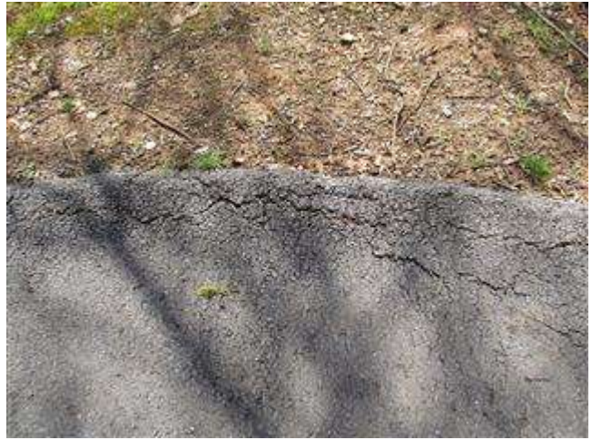
2 Asphalt Walking Path (March 2020)