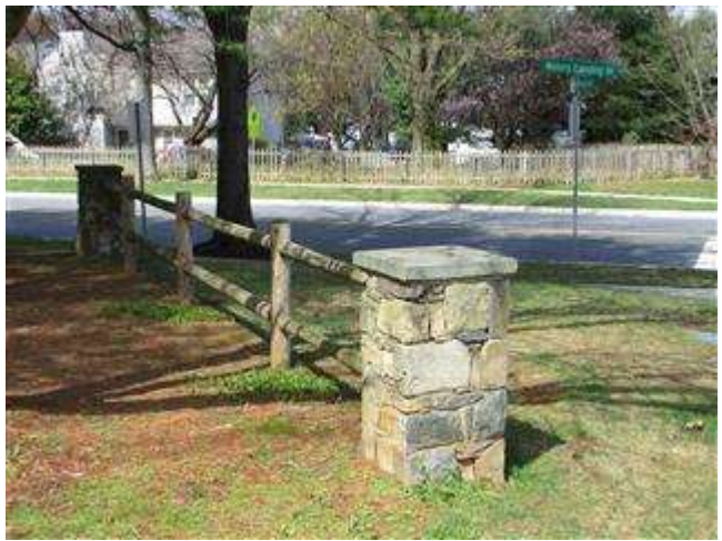
16 Stacked-Stone Monuments/Split Rail Fence (March 2020)