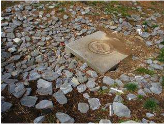
25 Stormwater Drain (near Tot Lot) (March 2020)