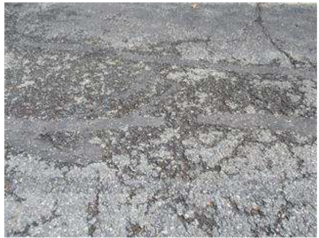
10 Asphalt: Roadway (Waters Row Terrace) (March 2020)