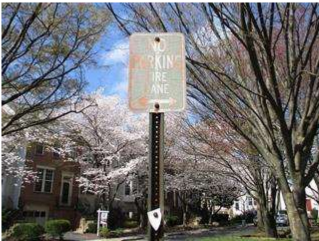
29 Signage (faded, unreadable) (March 2020)