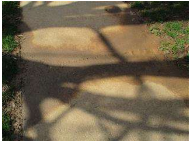
4 Concrete: Sidewalk (March 2020)