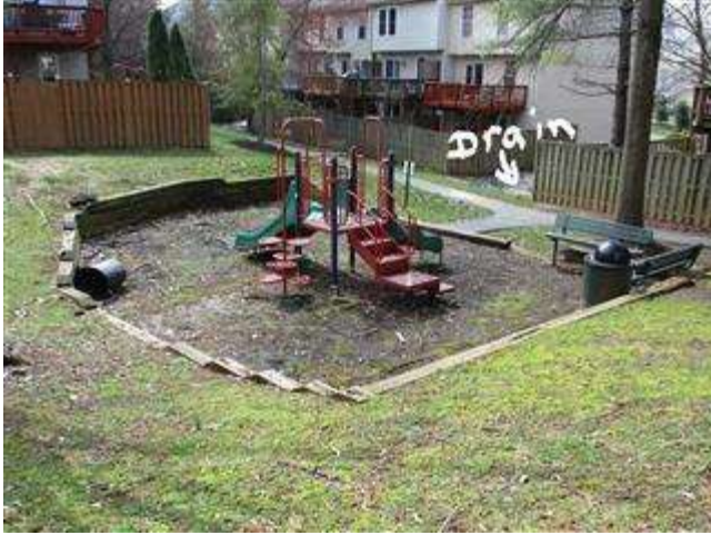
Most industry experts estimate the average lifespan of playground equipment to be around 10 to 15 years.