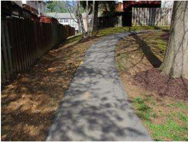
1 Asphalt Walking Path (March 2020)