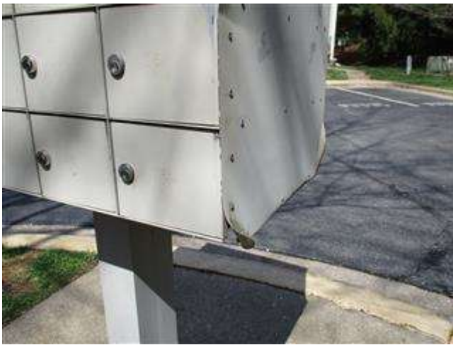
27 Cluster Box Unit/CBU (Mailbox) (March 2020)