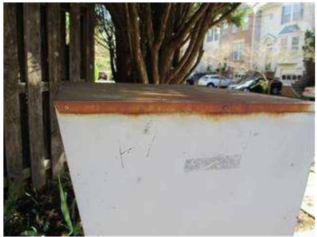
28 Cluster Box Unit/CBU (Mailbox) (March 2020)