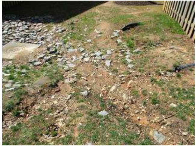
26 Stormwater Drain (near Tot Lot) (March 2020)