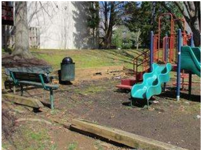
Most industry experts estimate the average lifespan of playground equipment to be around 10 to 15 years.