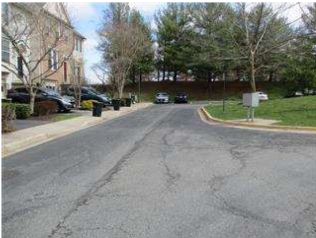
11 Asphalt: Roadway (Waters Row Terrace) (March 2020)