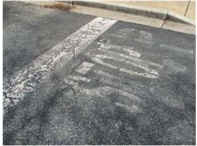
8 Asphalt/Stenciling on Roadway (March 2020)