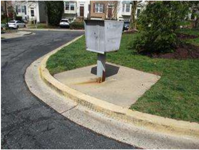
7 Concrete: Mailbox Pad (March 2020)