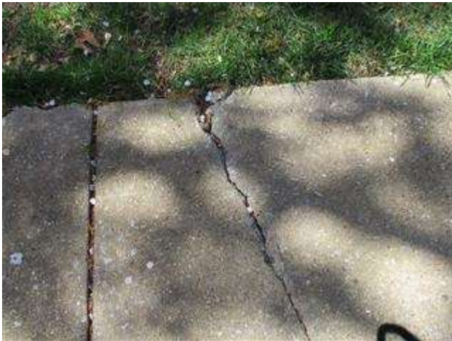
3 Concrete: Sidewalk (March 2020)