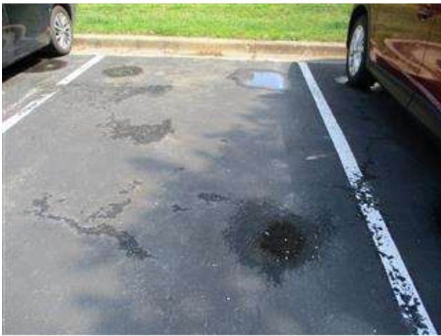
9 Asphalt: Parking Lane/Bay (March 2020)