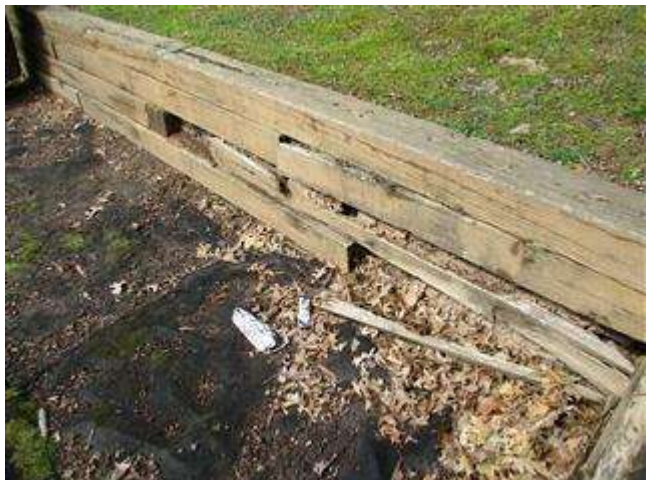
Most industry experts estimate the average lifespan of playground equipment to be around 10 to 15 years.