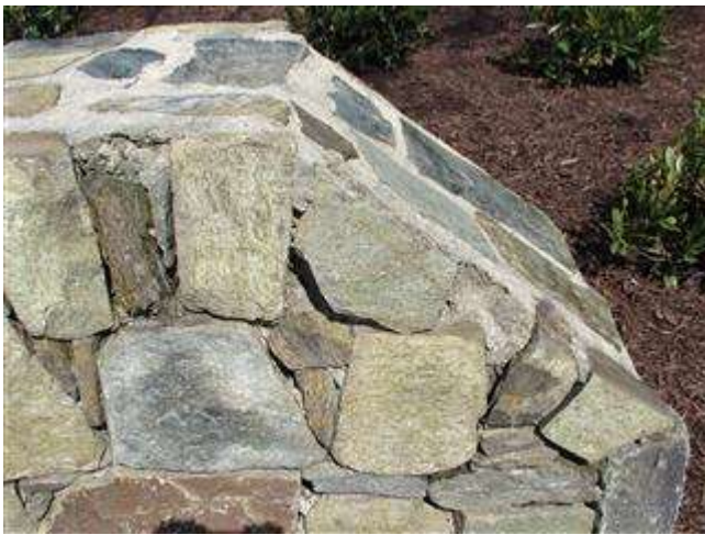
15 Front Entrance, Stacked-Stone Monument (March 2020)