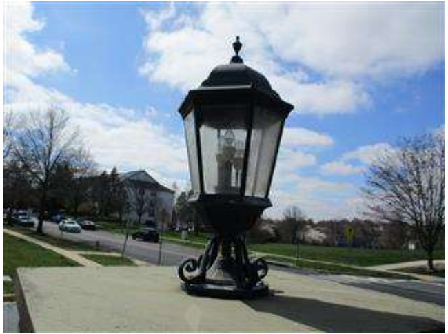
14 Front Entrance Light/Lantern (March 2020)