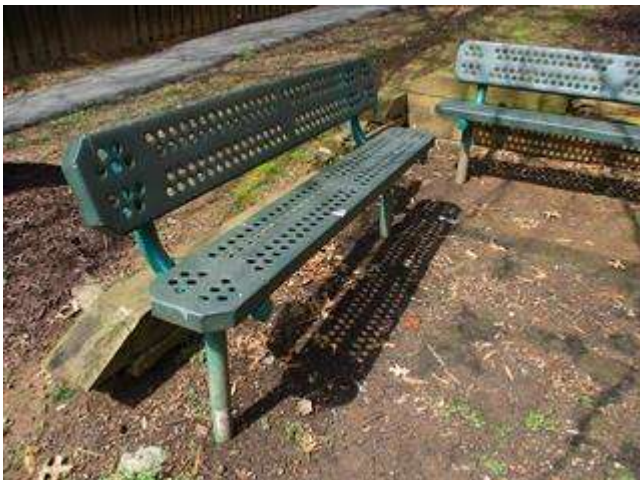
Most industry experts estimate the average lifespan of playground equipment to be around 10 to 15 years.