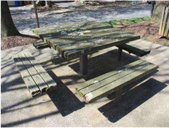
13 Picnic Benches/Table (Picnic Sitting Area) (March 2020)