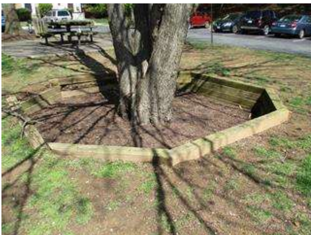
17 Tree Well/Planter (rotted wood, exposed rebar/steel bars) (March 2020)