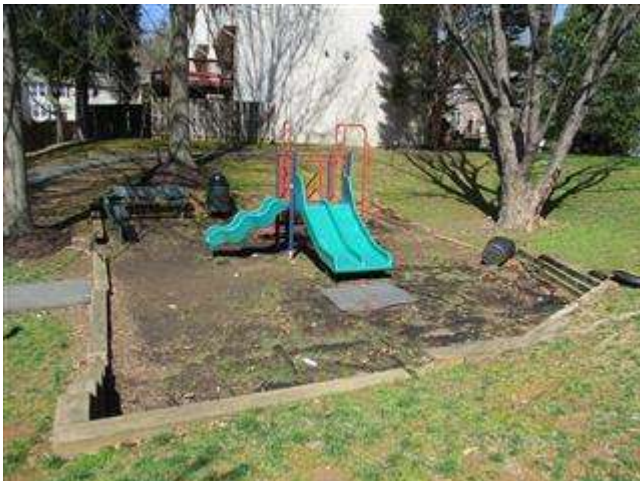
Most industry experts estimate the average lifespan of playground equipment to be around 10 to 15 years.